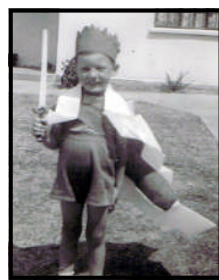
NALGO Croyde 195x/6x